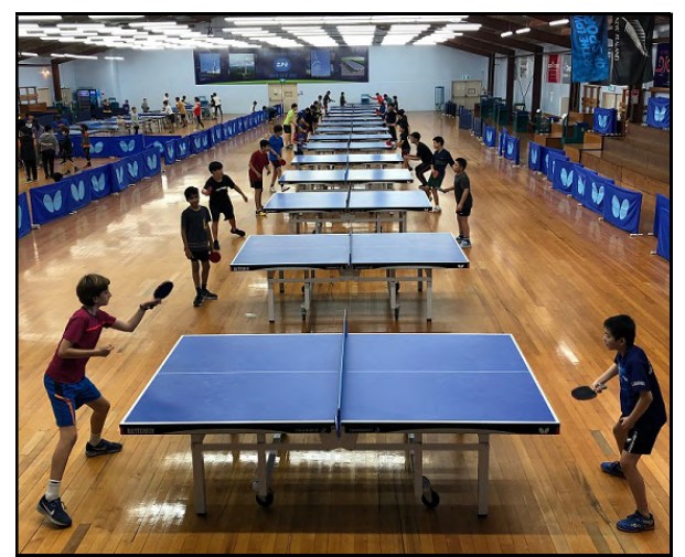
Participants in action at the 2020 July School Holiday Coaching programme

January 2020 – 92 students (from 57 students in 2019) April 2020 – cancelled (from 75 students in 2019) July 2020 – 102 students (from 99 students in 2019) October 2020 – 97 students (from 108 students in 2019)