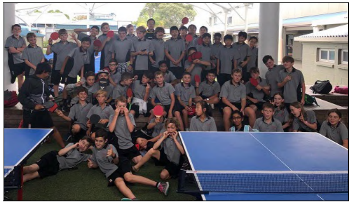
Students at Ponsonby Intermediate ready to partake in a table tennis development coaching session

Dinyar Irani delivered regular development coaching sessions to schools including ACG Parnell College, Glendowie College, and Pakuranga College.