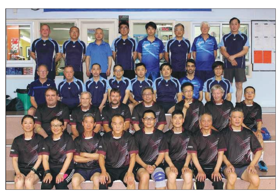
Auckland & North Harbour team members who contested the 2018 Battle of the Bridge contest