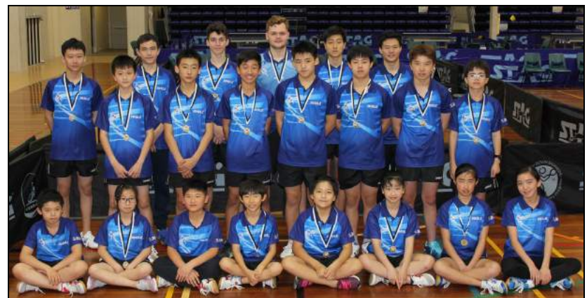
Auckland junior teams after being presented with their medals at the 2018 New Zealand Open Table Tennis Championships