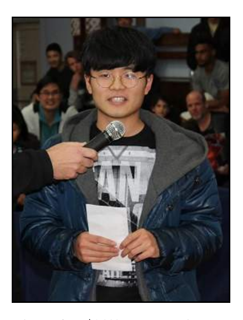
Winner of the $1,000 cash spot prize draw

The major spot prize draw at the Open Finals session was for $1,000 cash which created great excitement amongst the spectators present.